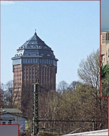
Schanze - Hamburg