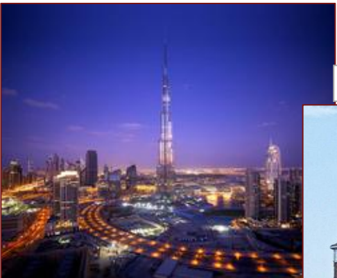
Berj Kahlifa - Dubai