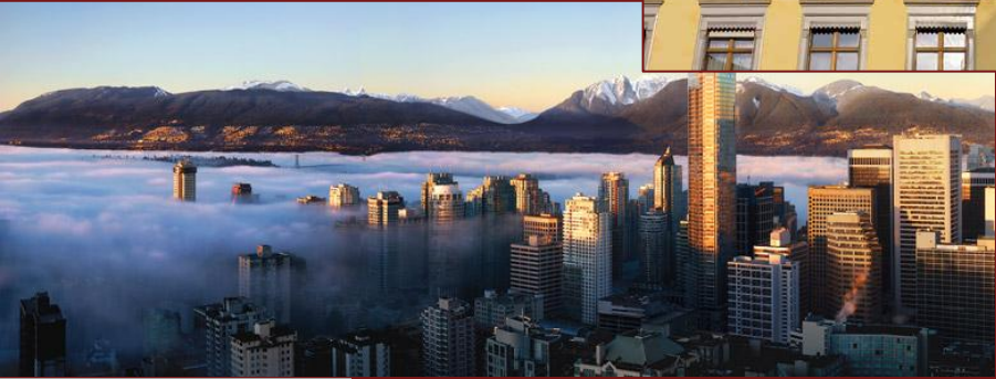
Shangri-La - Vancouver