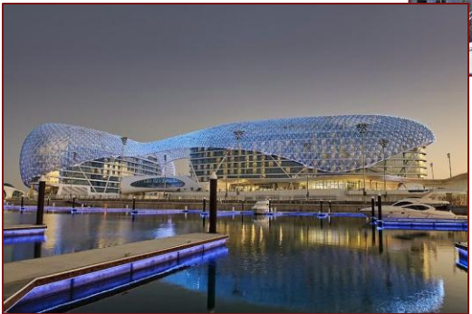
YAS - Abudhabi