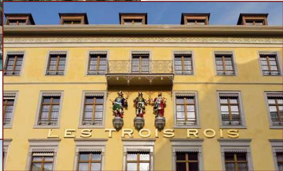
Les Trois Rois - Berne