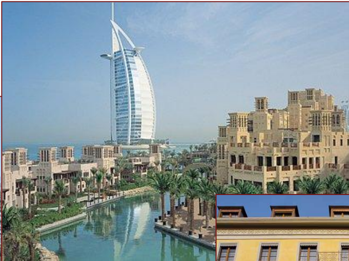
Madinat - Dubai